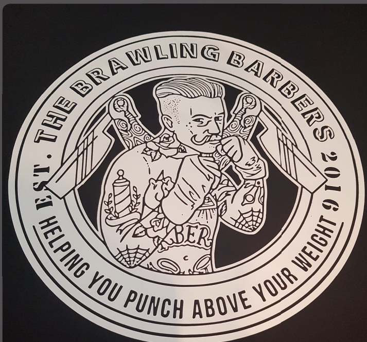
The design was printed for a local barber using HTV from TheMagicTouch

Drop us a line at editorial@images-magazine.com if you'd like one of your designs to be featured as our decorated product of the month